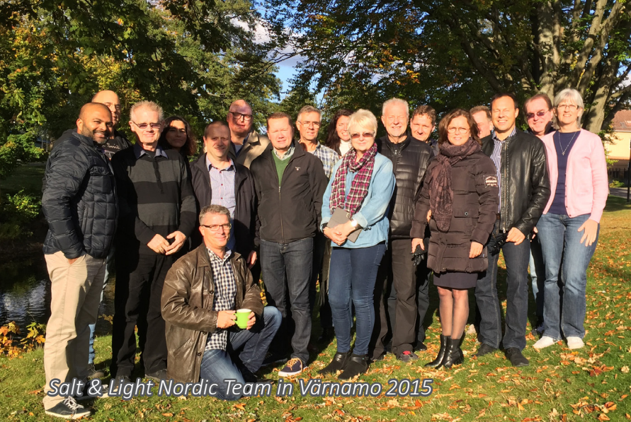
Salt & Light Nordic Team in Värnamo 2015