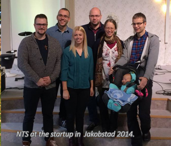
NTS at the startup in Jakobstad 2014.