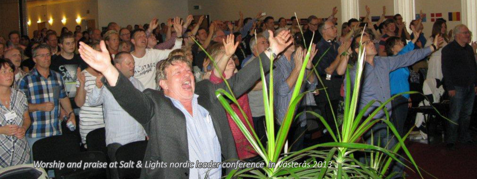
Worship and praise at Salt & Lights nordic leader conference in Västerås 2013